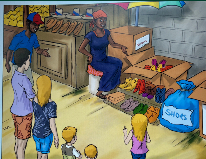
The guide told us that the lady with her shoes was a "micro-entrepreneur." The guide also said that the inventory was brought from the United States and was used to help people living in poverty create their own jobs.

Many thanks to our seven sister churches that donate to this project. And thank you, PCC family, for continuing to collect shoes and bringing them in for processing. Your shoes make a huge difference to those you will never even meet!!